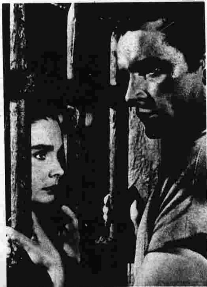
Jean Simmons with Richard Burton in the movie, "The Robe," Sunday 8-10:30 p.m. on ABC.