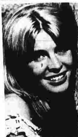
Julie Christie in the movie, "Young Cassidy," Friday 9-11 p.m. on CBS.

TODAY: "Miss Teen International Pageant," with 11 finalists from around the world, 9:30-10:30 p.m. SUNDAY: "Something About Believing," a religious jazz concert by Duke Ellington, 10-11 a.m. on CBS. "The Legend of Mark Twain," a visit to places the author knew, 4-5 p.m. on ABC. "What Color Is the Wind?", a documentary about twins, one blind, one not, 4:30-5:30 p.m. on NBC. "The Robe," with Richard Burton, Jean Simmons and Victor Mature, 8-10:30 p.m. on ABC. "Preview!" where rock music is at 10:30-11 p.m. on ABC. MONDAY: "Search in the Deep," third in the series of Jacques Cousteau's film, this one on giant sea turtles off Madagascar, 7:30-8:30 p.m. on ABC. "Mary McCarthy's Paris," the author as guide to city and people, 7:30 p.m. on Channel 24. "Movin' with Nancy," rebroadcast of show with Nancy Sinatra and father and brother and friends, 9-10 p.m. on NBC. TUESDAY: "The Lonely Dorymen — Portugal's Men of the Sea," fishermen at work in the fourth National Geographic Society program, 7:30-8:30 p.m. "The Lion," romance in Africa, with William Holden and Trevor Howard, 9-11 p.m. on NBC. "The Weapons of Gordon Parks," the Life photographer's rise through poverty, 10-10:30 p.m. on CBS. WEDNESDAY: "Negro Poetry," the work of five poets, 5:30 p.m. on Channel 24. THURSDAY: "The Enormous Egg," a children's tale narrated by Ed McMahon, 7:30-8:30 p.m. on NBC. "My Boy," 1921 silent movie with Jackie Coogan, 10 p.m. on Channel 24.