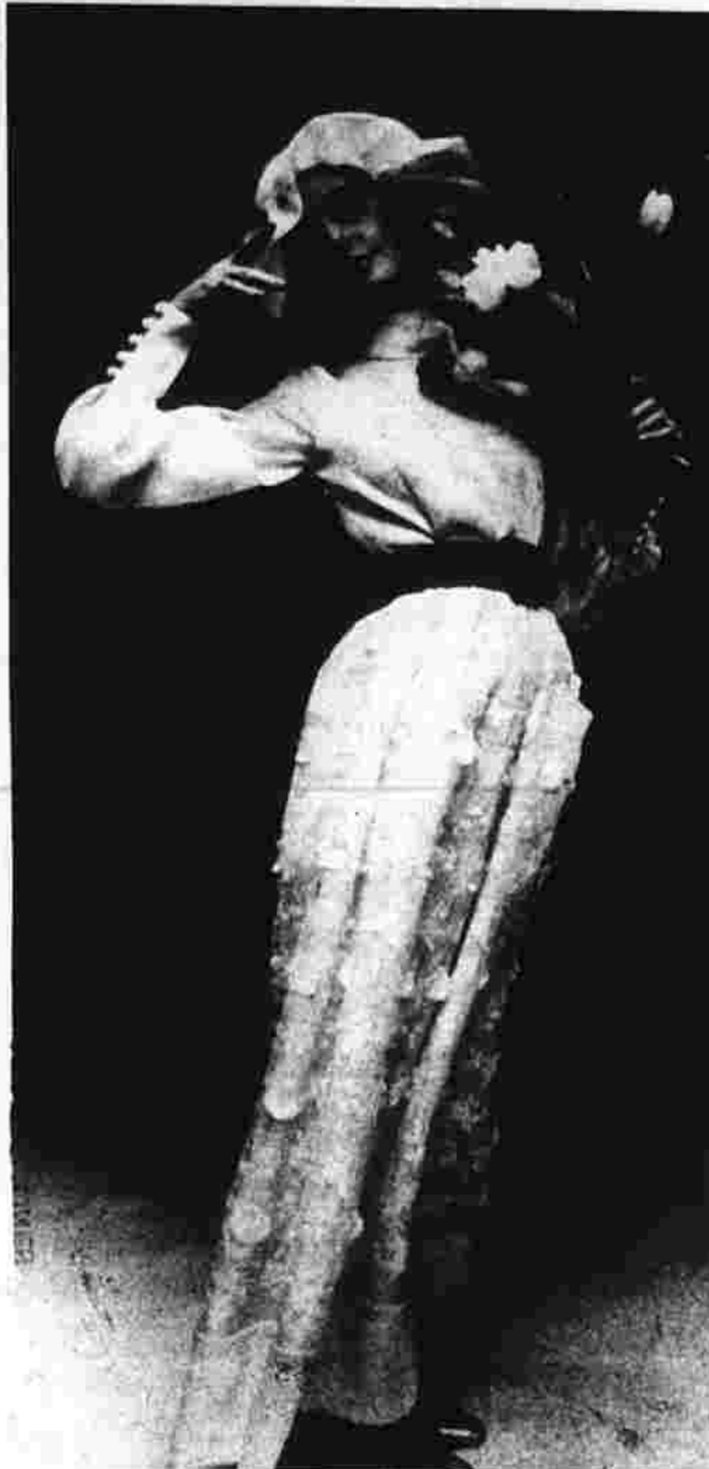
Model Heide Weideck in new summer outfit on ABC's "Preview!", a fast-paced look at new fashions, movies and rock music, Sunday 10:30-11 p.m. on ABC.