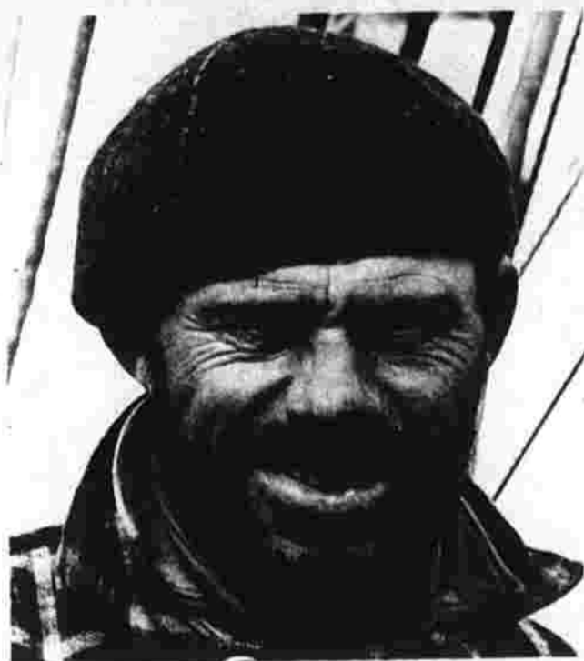
Fisherman in "The Lonely Dorymen—Portugal's Men of the Sea," Friday night at 7:30 on CBS.